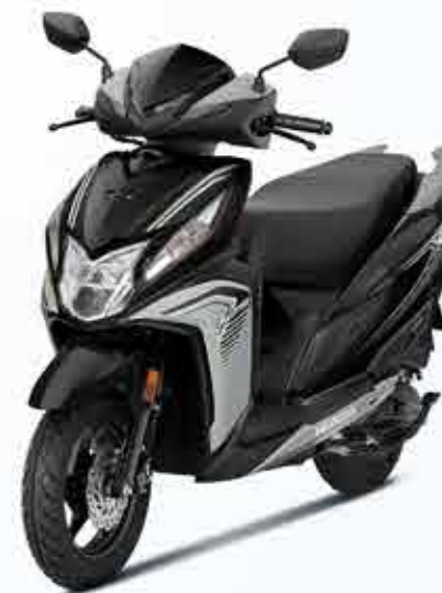
PEARL DEEP GROUND GRAY (STRIPE)