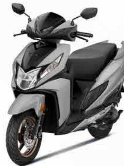
PEARL DEEP GROUND GRAY (EMBLEM)